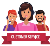
CUSTOMER SERVICE Customer service