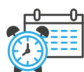
Excellent time management