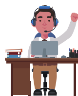
Customer Service Representative