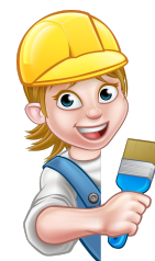
Painter and Decorator